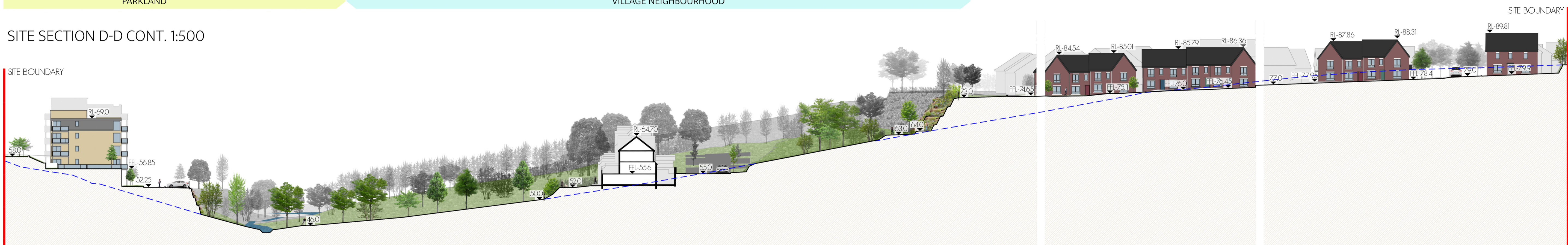
SITE SECTION D-D CONT. 1:500

CARRS HILL APARTMENTS CYCLE WAY GREENWAY PARKLAND VILLAGE NEIGHBOURHOOD