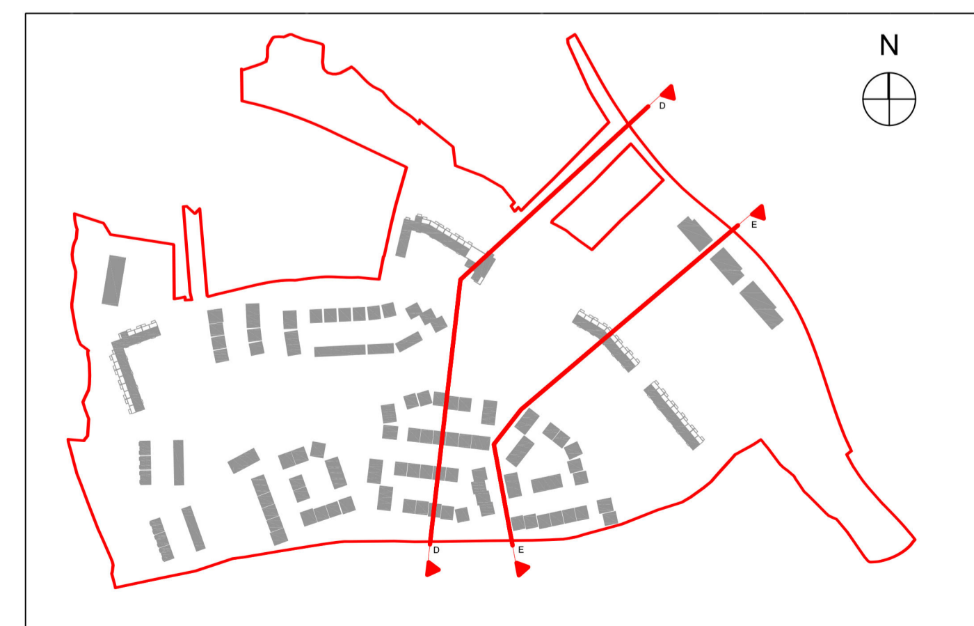
SITE KEY PLAN 1:5000